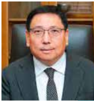
Dossaev Erbolat Akim of Almaty