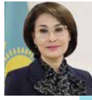
Alnazarova Akmaral Minister of Health of the Republic of Kazakhstan