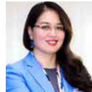
Nusupova Assem Deputy Akim of Almaty